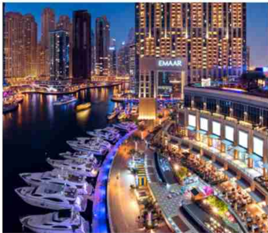
150,000 Sqm Marina Mall