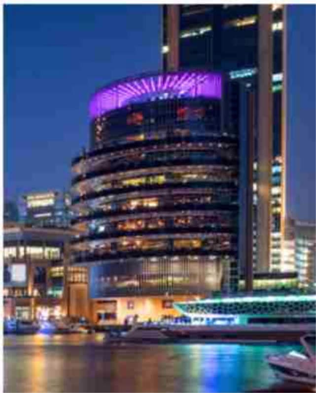
Global Culinary Hub Pier 7