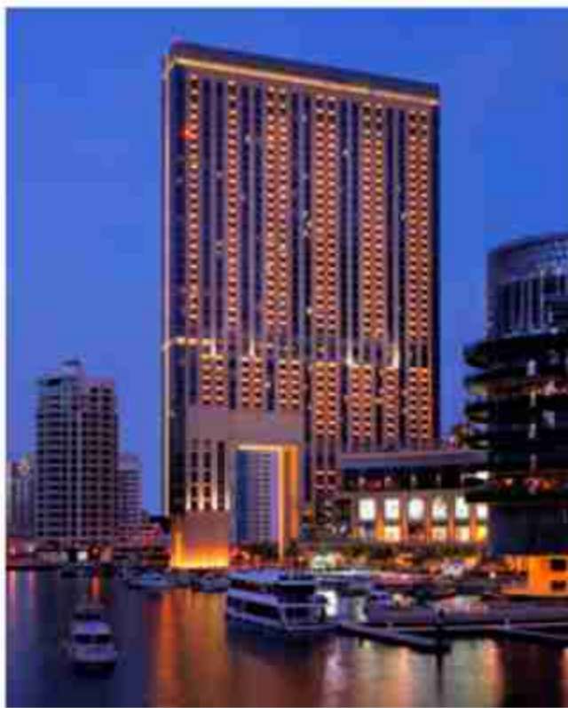
5-star Premium Hotel, The Address Dubai Marina

Famous for its vibrant nightlife, exceptional dining venues and an abundance of activities that will satiate your every desire.