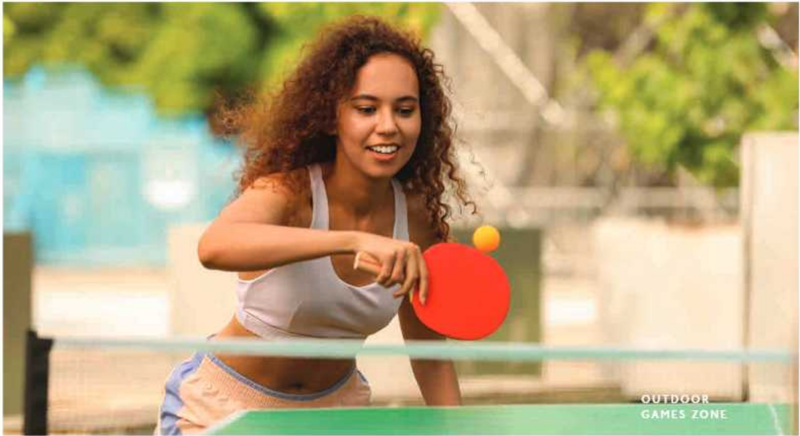
OUTDOOR GAMES ZONE