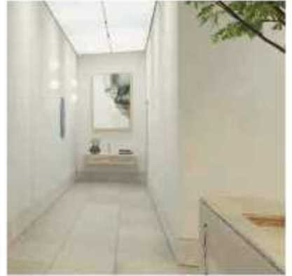
LOBBY & LIFTS