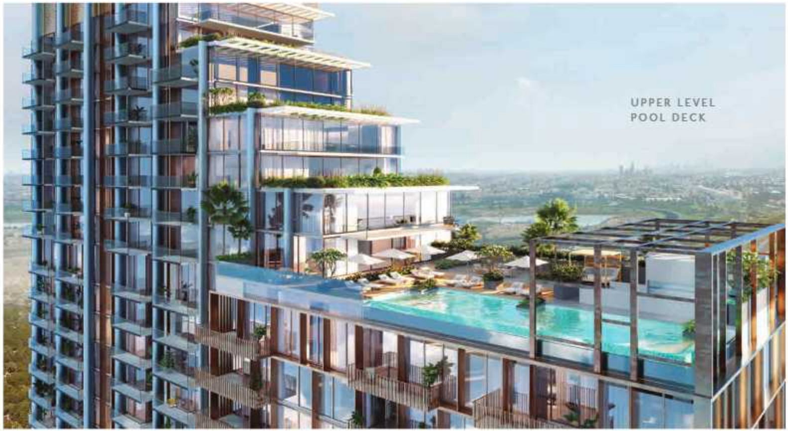
UPPER LEVEL POOL DECK