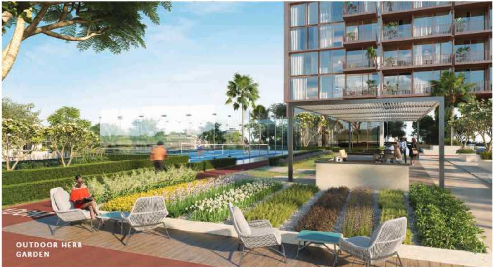
OUTDOOR HERB GARDEN